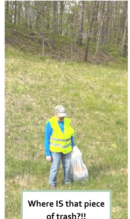
Where IS that piece of trash?!!

It was a great day followed by Pizza for all the volunteers.